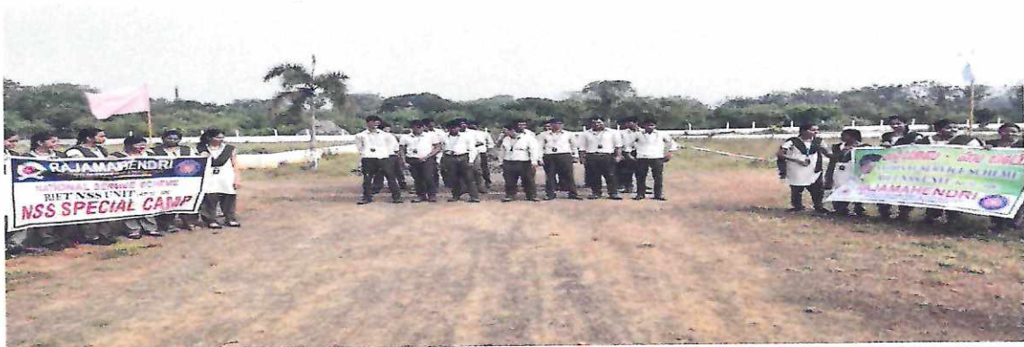
CLEAN AND GREEN CAMPUS INITIATIVES BY NSS UNIT