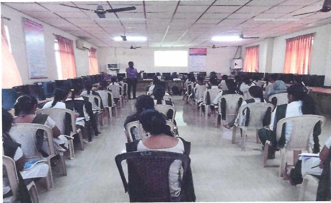
Campus placement drive by Netenrich Technologies Pvt. Ltd