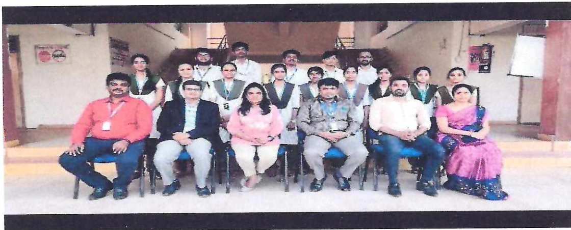
Shortlisted students with management, principal and HCL HR team-2023