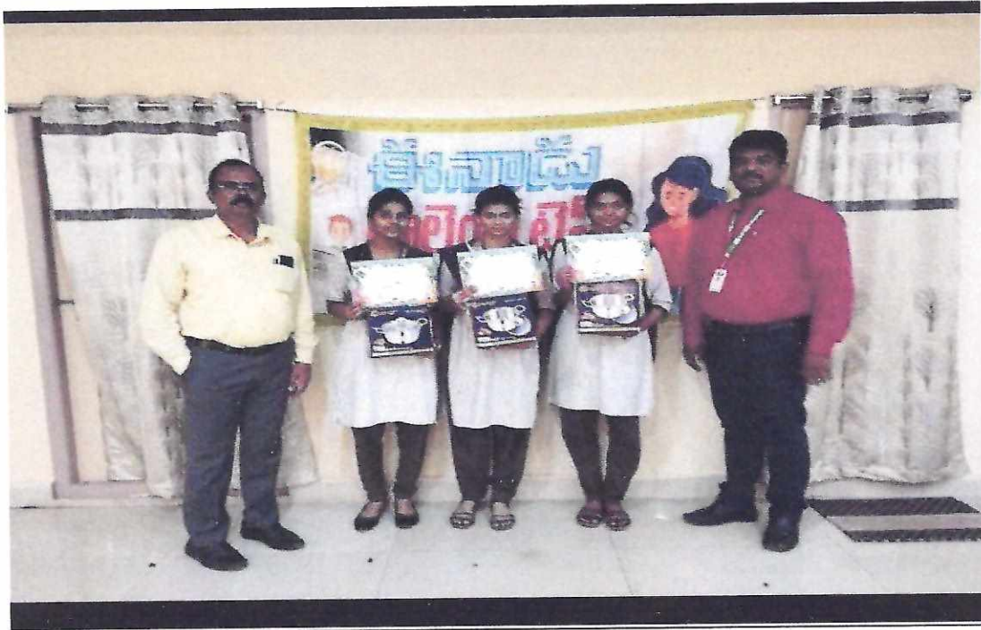
EENADU TALENT TEST WINNERS