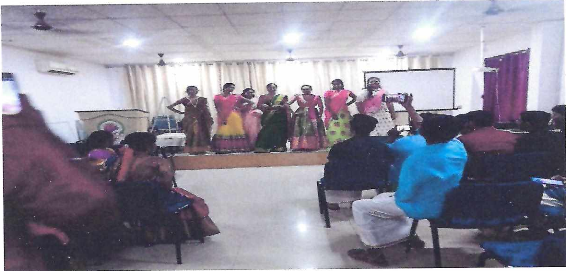
Fashion parade by students